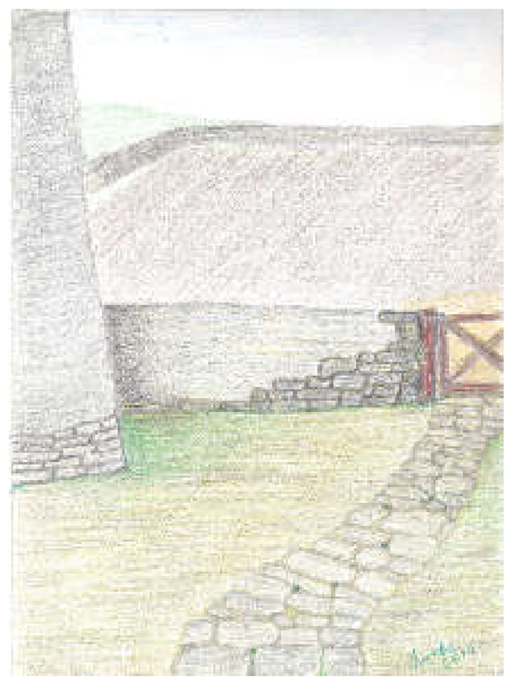
A View of the Broch by: Finche Odhinnsdottir 2019